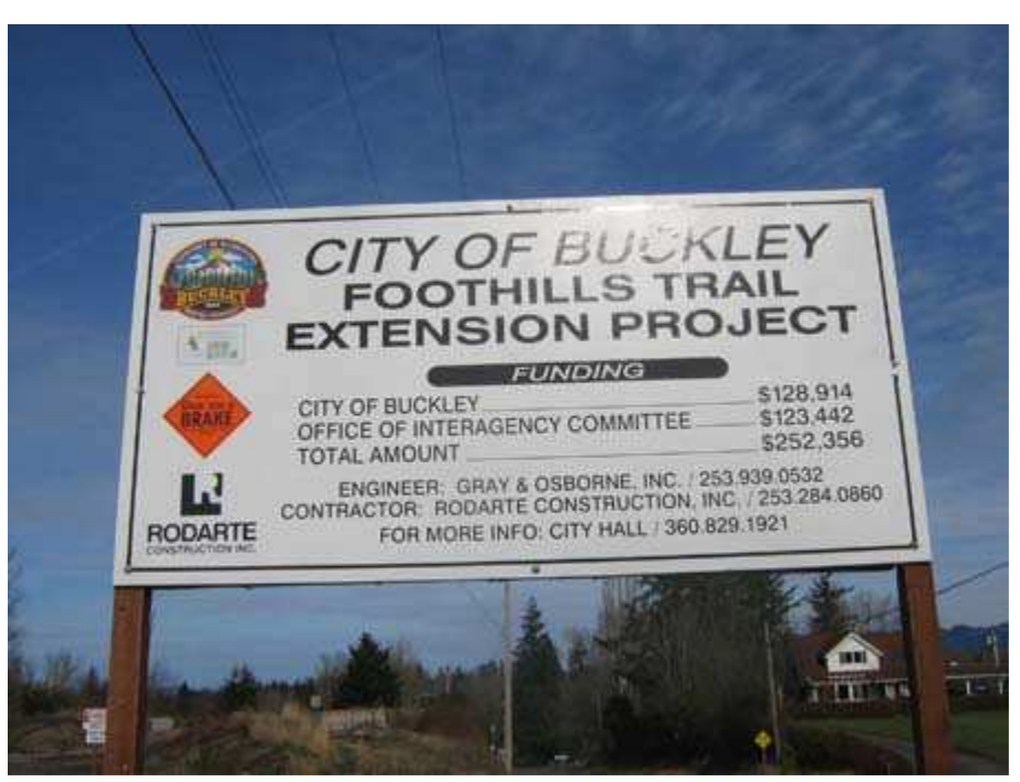
Now we arrive at the trails of the green triangle, i.e. the green contractor + green government + green Futurewise