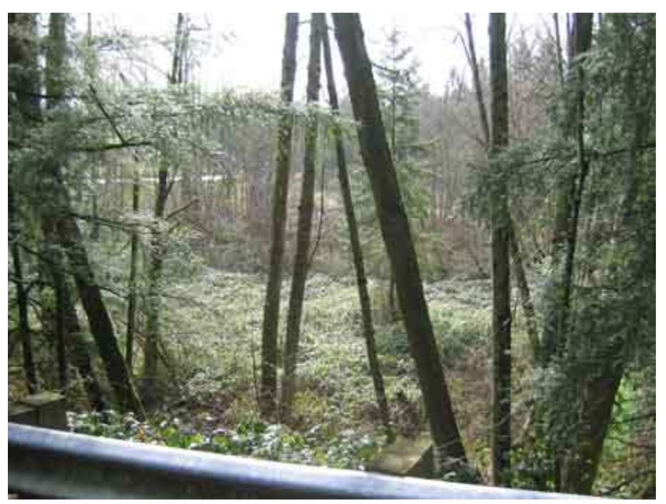
Trails over swamps, trails over Mud Mountain road

Trails thru wetlands, trails thru aqueducts, trails thru natural gas, trails of fools. Rural land owners cannot do anything with their buildings or land, at the same time they are forced to pay unconstitutional property taxes and have their wages and land stolen while the state, county and city government corporations build trail over swamps and rivers.