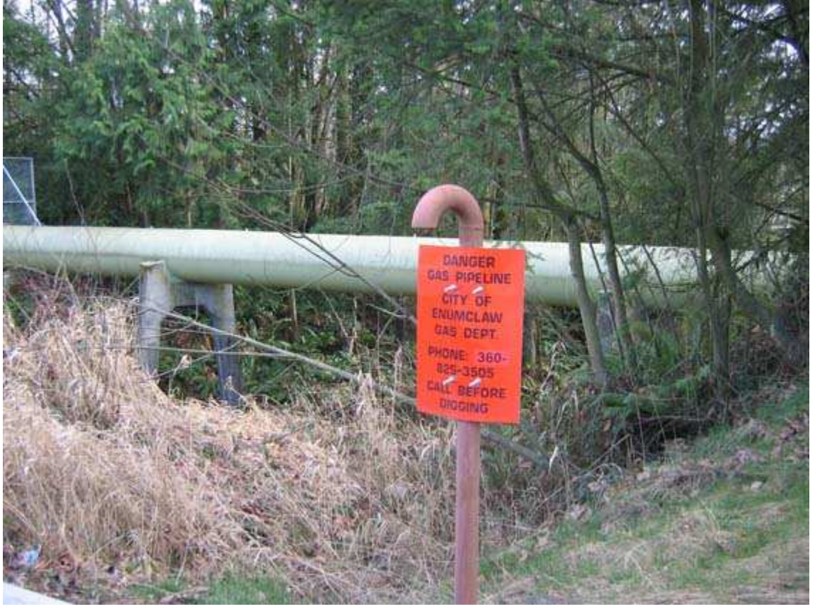
Gas lines, water aqueducts, gorges, private property, all add up to more tears of taking