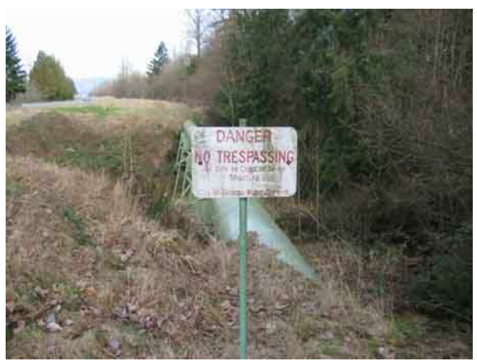
Danger lurks along the Trail of Tears