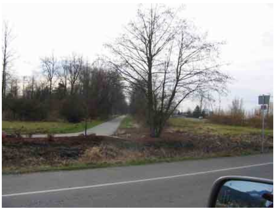
A trail to no where, a systematic taking of private property owners one by one. King County attorneys appear to be doing the "visiting" outside the city limits.