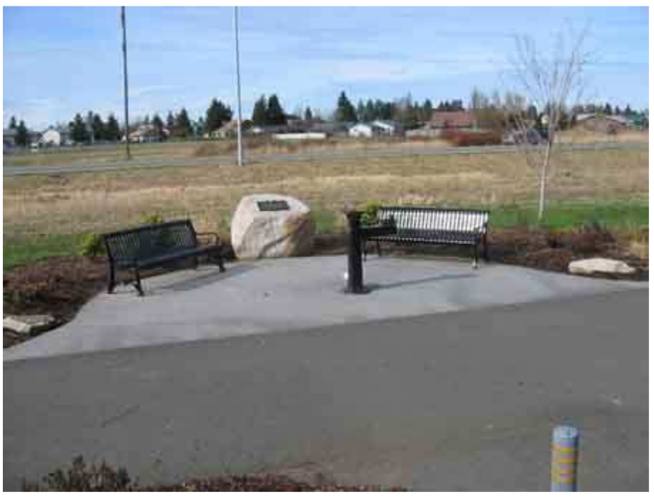
It looks so innocent and pretty. A drinking fountain and a couple of benches along the Trail of Tears.