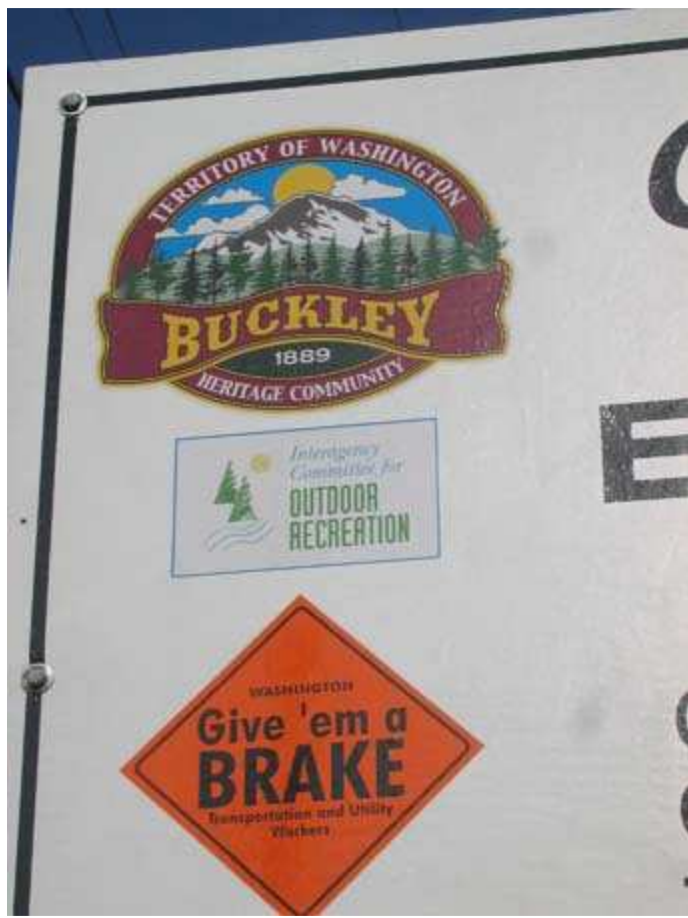
$252, 356 for a 12' wide paved dead ends path from Buckley to the White.