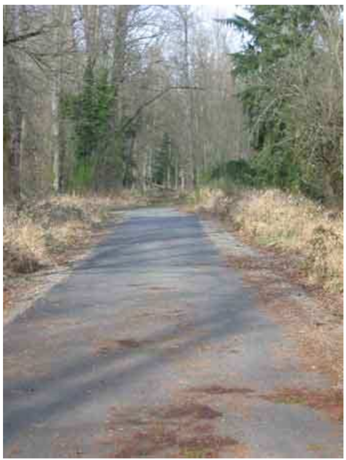
This is the end of the trail of tears from Buckley, Washington dead ending at the White River.

We are guessing they are planning to use one of these sets of bridge footings for the foot bridge.