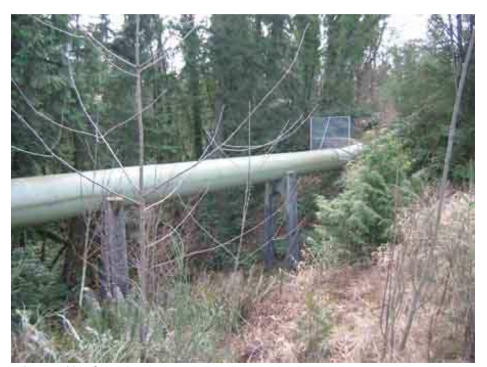
The trail of nonsense not common sense.