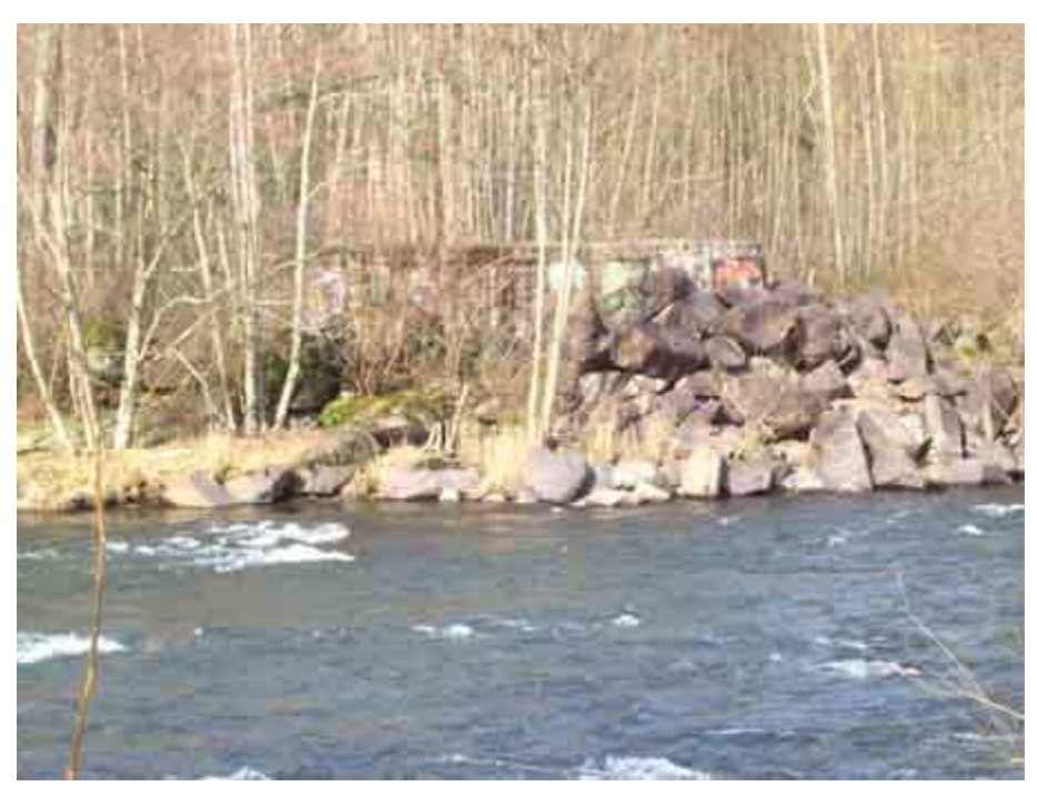
You can see the railroad trestle footing foundation.

It is some 8 to 10 feet high. I am told that the foot bridge alone spanning the White River is estimated at $1 million dollars. This project must be stopped. Property taxes, sales taxes and income taxes are unconstitutional and illegitimate. There is no law forcing anyone in the sovereign states to pay any taxes. Sales taxes are excise taxes and must be paid by businesses directly. Property taxes are unconstitutional and being successfully challenged in at least 4 states. Federal and state income taxes are unconstitutional. Wake up America. City, state and federal governments are corporations and have no jurisdiction or authority over your private property.